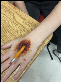
Special Effects Makeup Certificate 2022/23